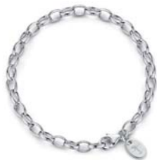
◆ FJ 1.007 | € 49,00